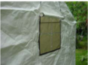
Window with Velcro Flap

OPTIONS- Extra doorways, windows, center curtains, room dividers, stove rings, signage, etc.